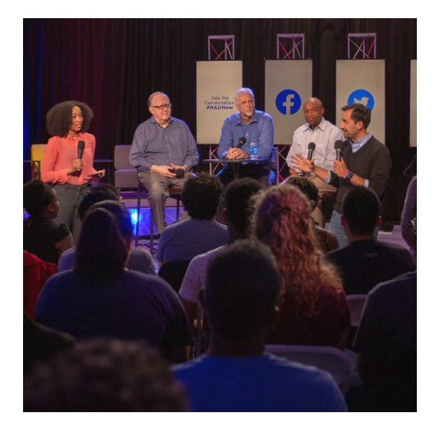
June 21, 2019

On May 22, at the Life Adventist Church of Berkeley, California, the fourth episode of "Is This Thing On?" (ITTO) broadcast on Facebook and YouTube during the 2019 Adventist Christian Fellowship Institute. Approximately 100 young adults gathered to dialogue with NAD officers. <u>MORE</u>